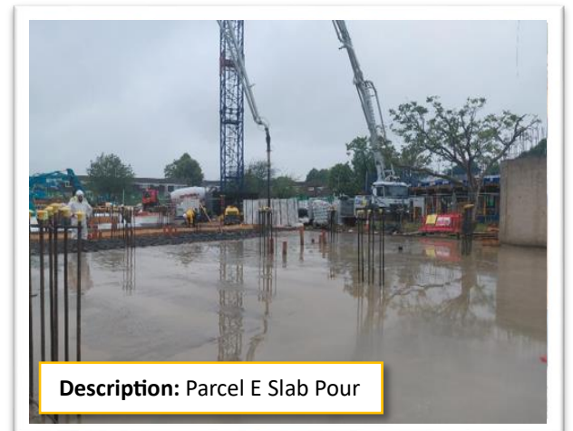
Description: Parcel E Slab Pour

As advised last month our newsletters are now online or available via the QR code. If you would like to receive future copies directly via email, please contact us at enquiries@bugler.co.uk and reference the project name to be added to the mailing list.