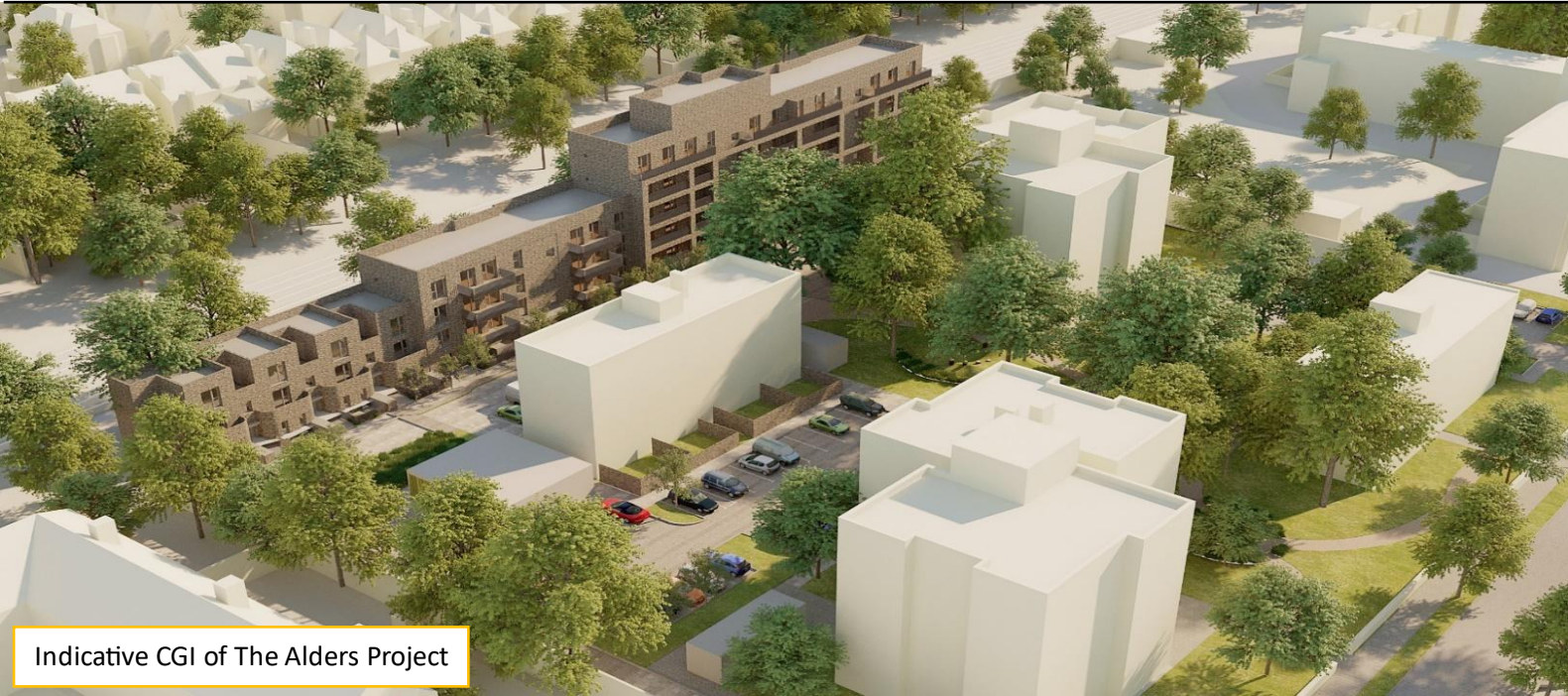
Indicative CGI of The Alders Project