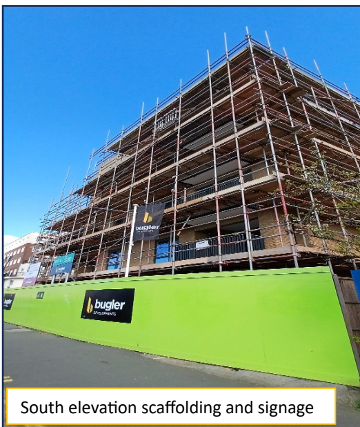
South elevation scaffolding and signage

Scaffolding is currently being erected and has been erected up to the fifth floor of the building. This will continue over the coming weeks.