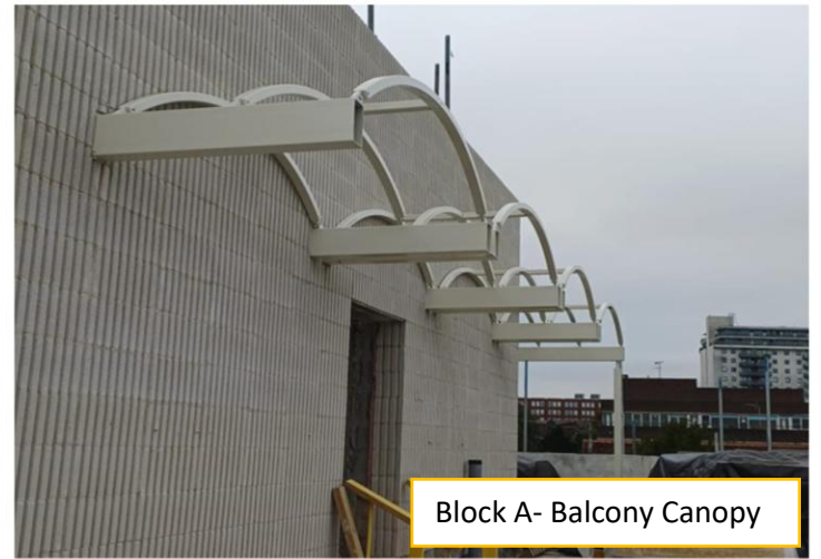
Block A- Balcony Canopy