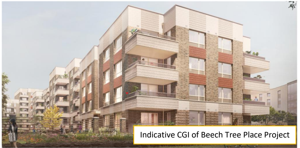
Indicative CGI of Beech Tree Place Project

Lastly, in Block D , Lift 2 has been installed, the fourth and fifth floors are now closed up and plastered, third and fourth floors have received mist coats, and kitchens on the second and third floors have been completed.