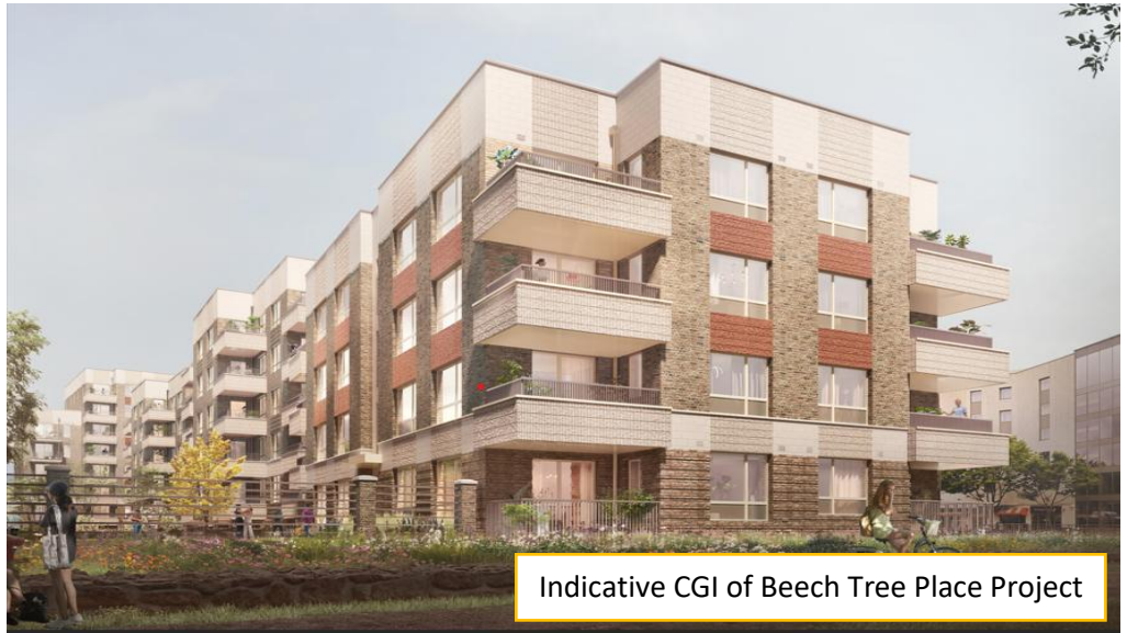
Indicative CGI of Beech Tree Place Project

Block D – Brickwork and blockwork externally and internally is now complete up to level 5. Windows and balcony doors have now been installed up to level 4 and internal studwork wall installation has commenced.