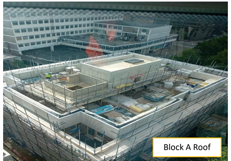
Block A Roof