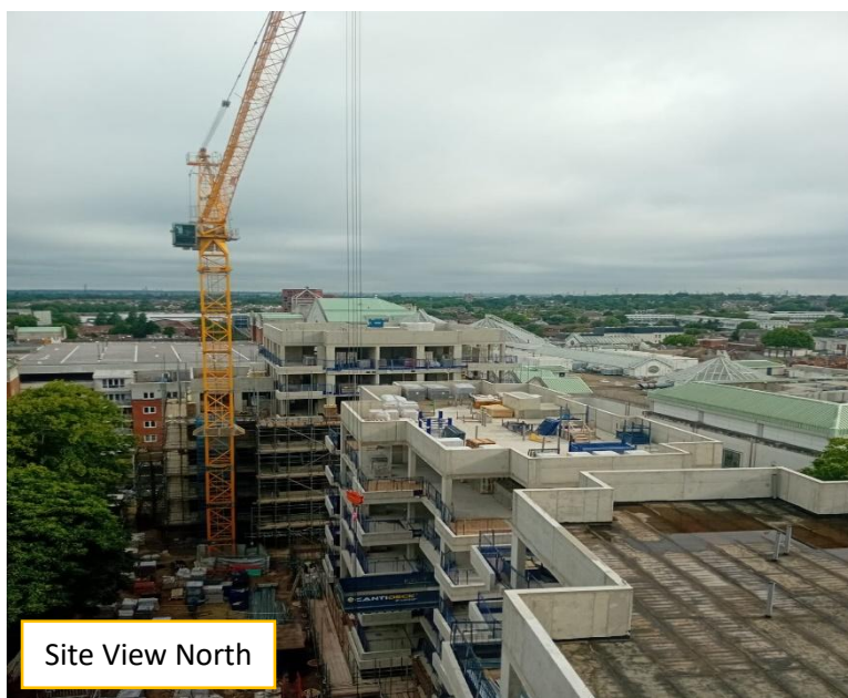
Site View North