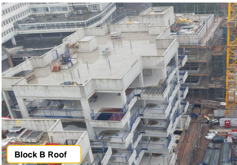
Block B Roof