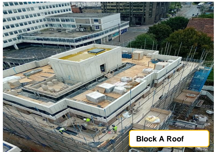
Block A Roof