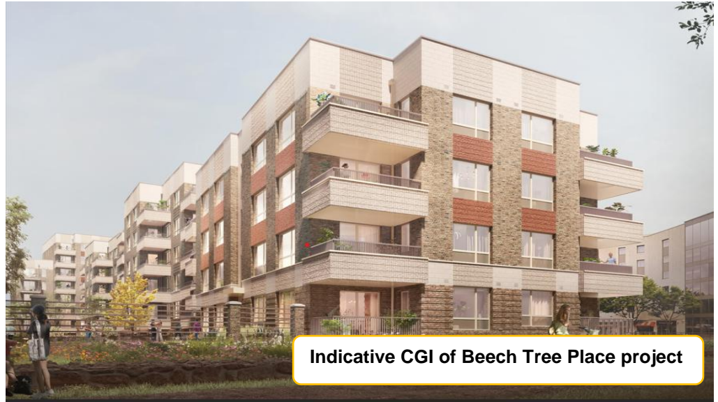
Indicative CGI of Beech Tree Place project

During construction, we prioritise sustainability through waste segregation, eco-friendly materials and energy-efficient processes. Our forklift runs on Hydronated Vegetable Oil fuel, reducing carbon emissions and reliance on fossil fuels. These efforts reflect our commitment to a greener, healthier community and a significant reduction in net CO 2 emissions.