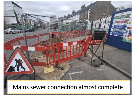
Mains sewer connection almost complete