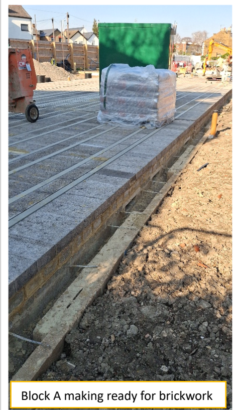
Block A making ready for brickwork

Underground drainage installation within The Mews will also continue over the coming weeks.