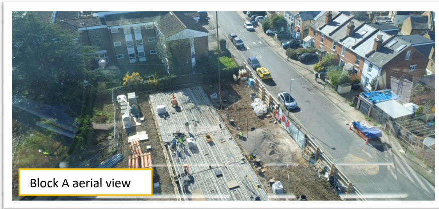
Block A aerial view