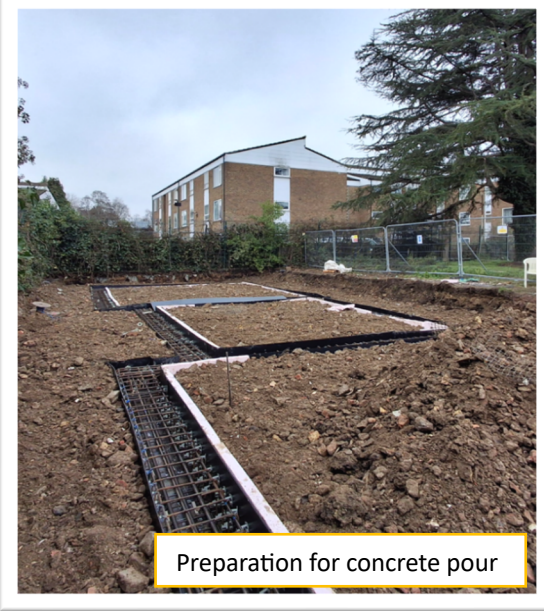
Preparation for concrete pour

We will also be constructing the perimeter drainage system with attenuation tanks, which helps manage surface water around the building, commencing with the splash course, the protective brick layer at the base of the walls. These activities will support the transition from substructure works towards the early stages of the superstructure.