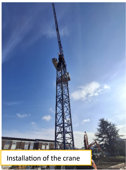
Installation of the crane